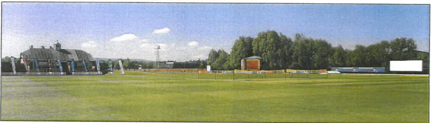
Spytty Park - ICC Trophy Training Base (June 2013)