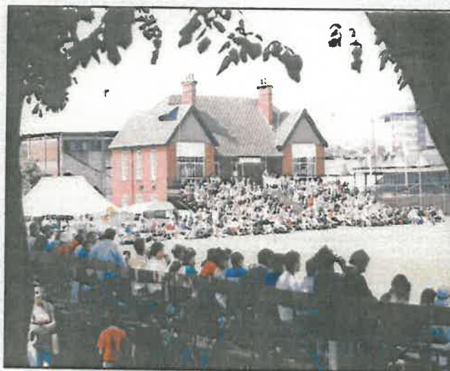
Glamorgan v Derbyshire at Rodney Parade (1988)