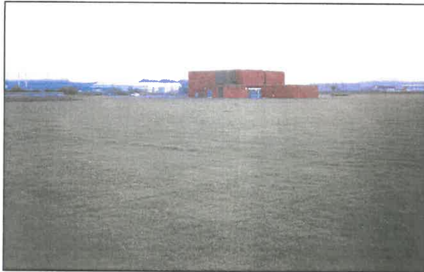
Spytty Park Before Building Began (May 1990)